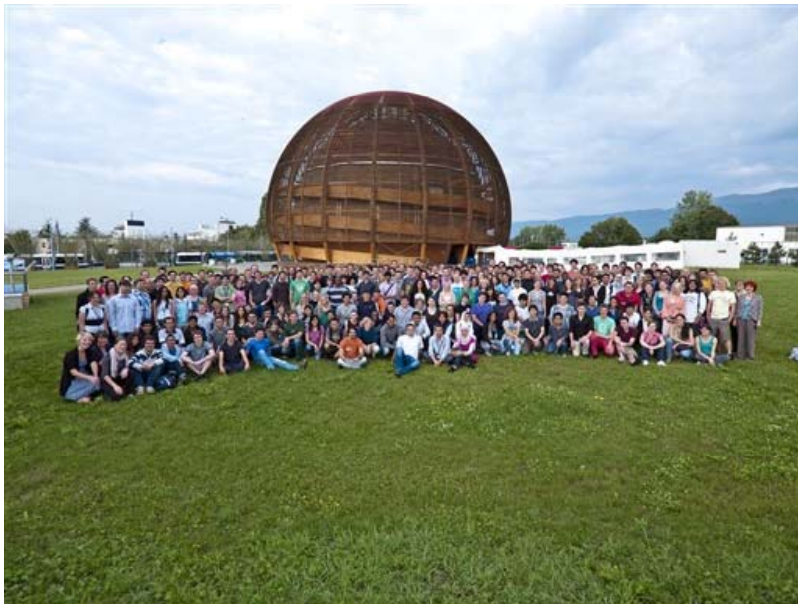
2011 summer students

Deadline for applications: 25 January 2012